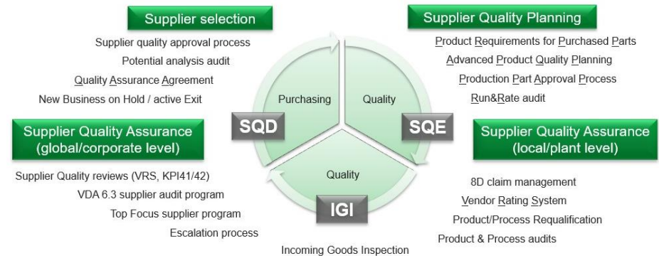
Diagram "Supplier Quality Lifecycle"

followed by the Advanced Product Quality Planning (e.g., APQP) and the Production Part Approval Process (e.g., PPAP), we are regularly monitoring parts' quality and the quality and delivery performance of our supply base during series production.