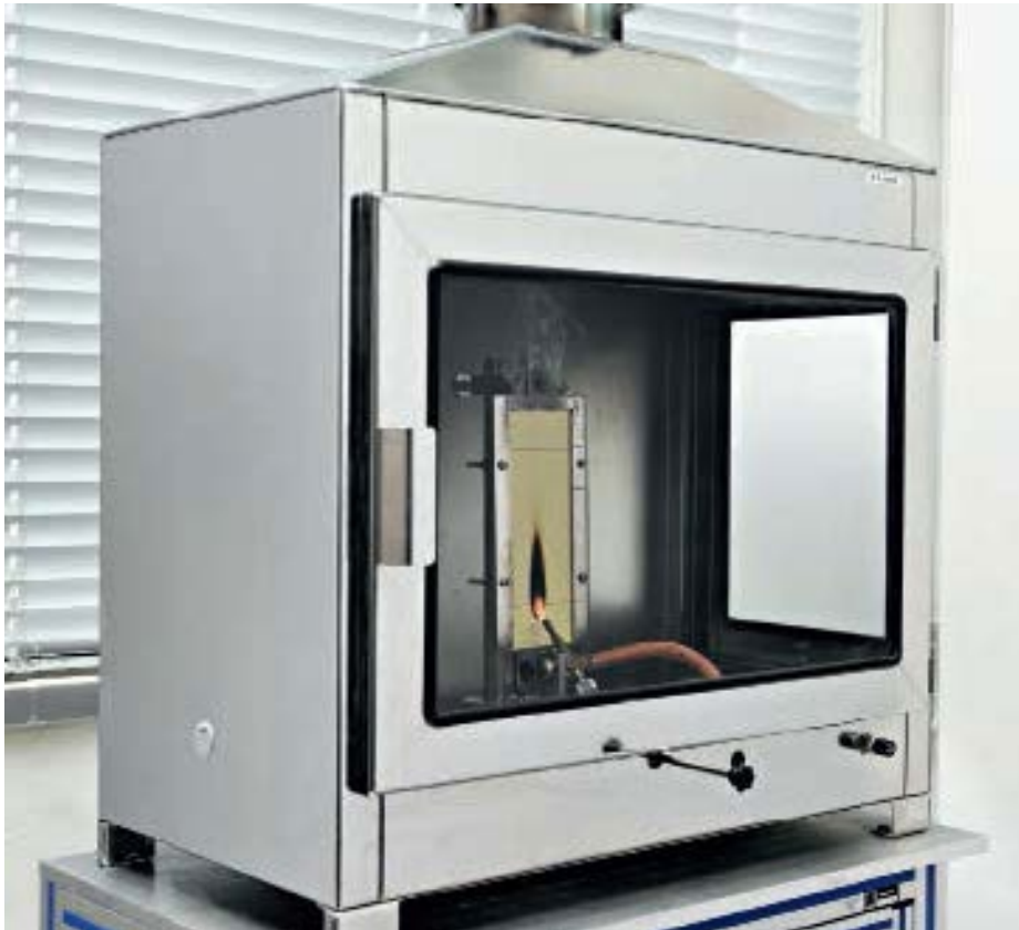
Flammability testing of an air filter paper in accordance with DIN 53 438-3

In this regard the "cellulose" filter media portfolio is continuously growing today and covers an enormously wide spectrum of applications and modifications, effectively shifting established standards to innovative high-performance media.